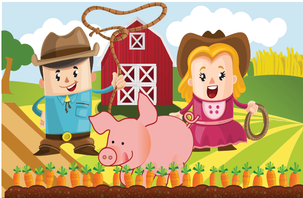
Illustrations from Veceevy.com